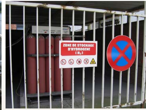
Gas substation hydrogen substation