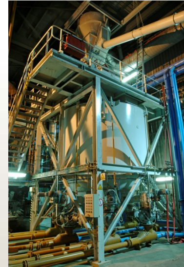
T4 Grinding mills

T4: Flying wood ash, powdery and caustic